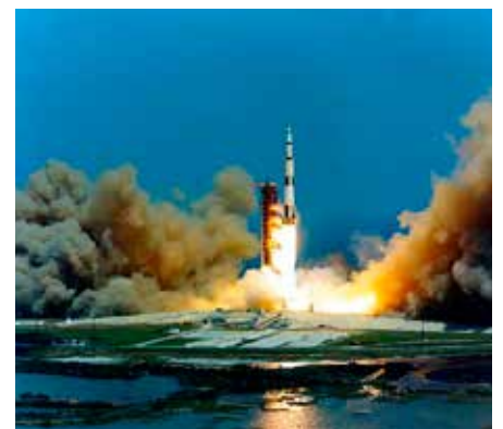
Apollo 16 launched from Kennedy Space Centre

landmarks, Stone Mountain and the North Ray crater, visited. Samples taken from the rim of North Ray crater later proved to be bedrock thrown up from the meteorite impact that had created it. In three subsequent excursions onto the lunar surface, Duke and Young spent more than 20 hours exploring the moon. This involved placement and activation of scientific equipment and experiments, the collection of nearly 213 pounds of rock and soil samples, and the evaluation and use of Rover-2 (their lunar car) over the