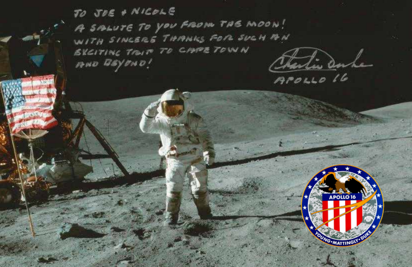
Charlie Duke on the moon