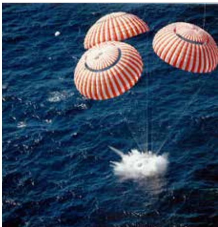
Apollo 16 concluded with a Pacific splashdown

When the crew returned to orbit, tensions rose as it was discovered that a faulty engine on Casper, the Command Module, had to fire. The module was taken around the far side of the Moon where the burn would take place as Mission Control waited for news. The burn had the desired effect as the astronauts re-established radio contact, and entry and landing proceeded as normal. Apollo 16 concluded with a Pacific splashdown and subsequent recovery by the USS TICONDEROGA.